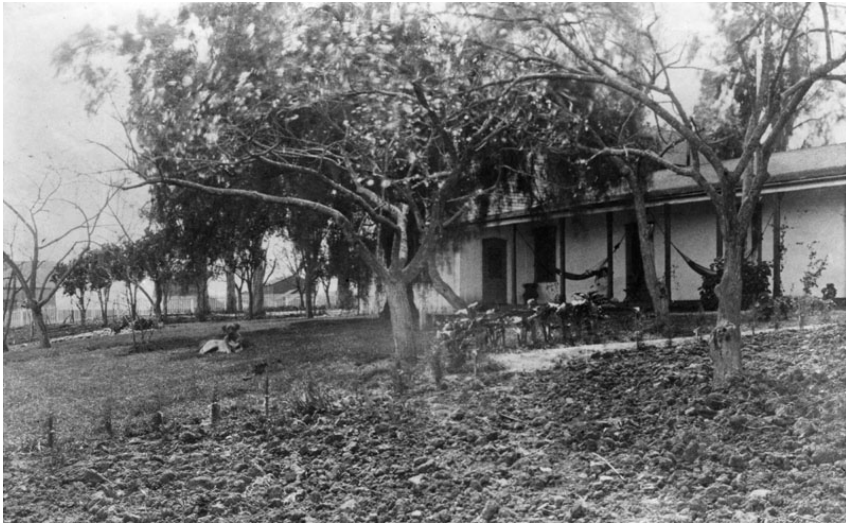
Top Photo: Adobe in 1890